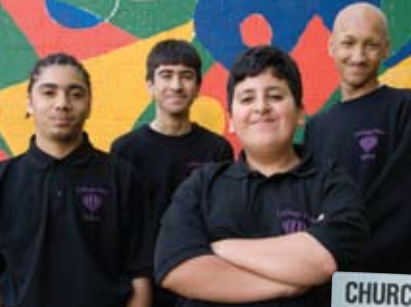
CHURCH STREET W2 CITY OF WESTMINSTER