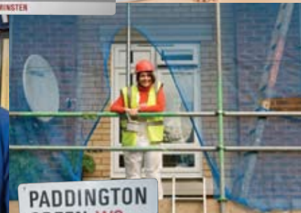
PADDINGTON GREEN W2 CITY OF WESTMINSTER