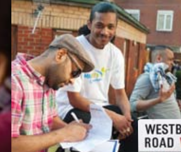
WESTBOURNE PARK ROAD W2 CITY OF WESTMINSTER