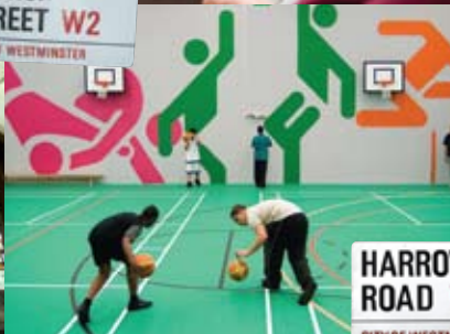
HARROW ROAD W2 CITY OF WESTMINSTER