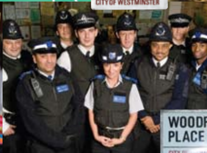
WOODFIELD PLACE W9 CITY OF WESTMINSTER