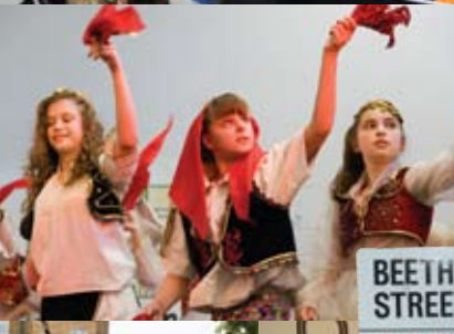
BEETHOVEN STREET W10 CITY OF WESTMINSTER