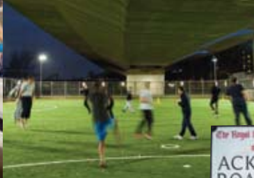
ACKLAM ROAD, W10 The Royal Borough of Kensington and Chelsea