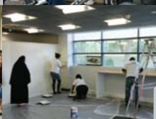
SHIRLAND ROAD W9 CITY OF WESTMINSTER