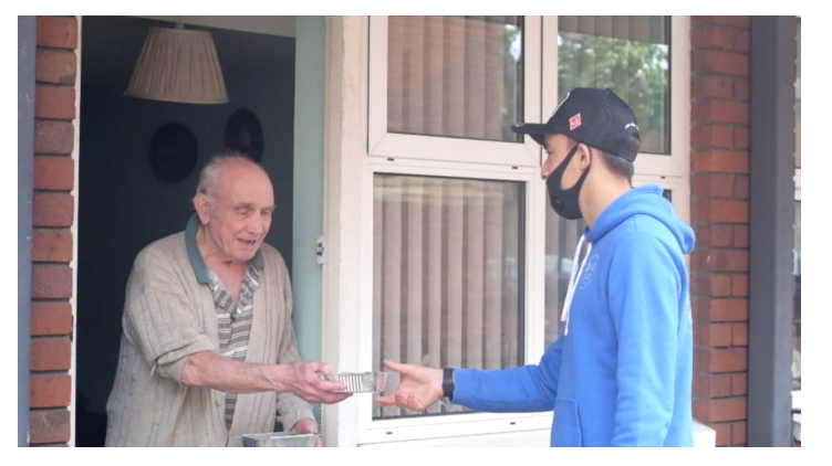
QPG Hub delivering Ida Restaurant food to local residents during 2020 COVID pandemic filmed by Their Story for Lockdown Meals short film.